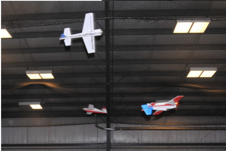
Three airplanes in the picture at once! We have as many as four flying at the same time upon occasion. Five if you include the little quad copter in the corner.