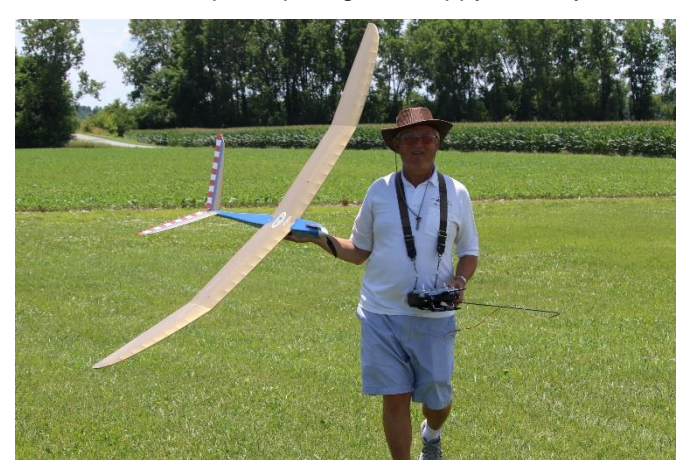
Thanks to all for participating and happy 4th July!