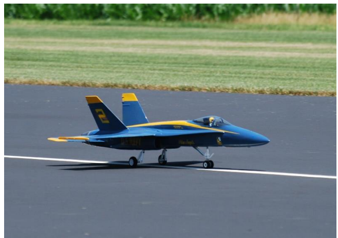
Yellow Aircraft F/A-18s converted to EDF