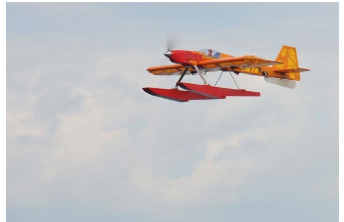
Don Vetrone-Fun Star