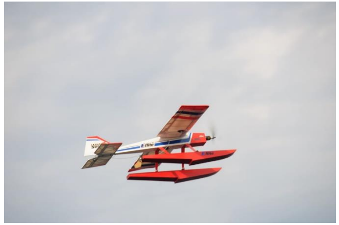
Bill Moran Ultra Stick