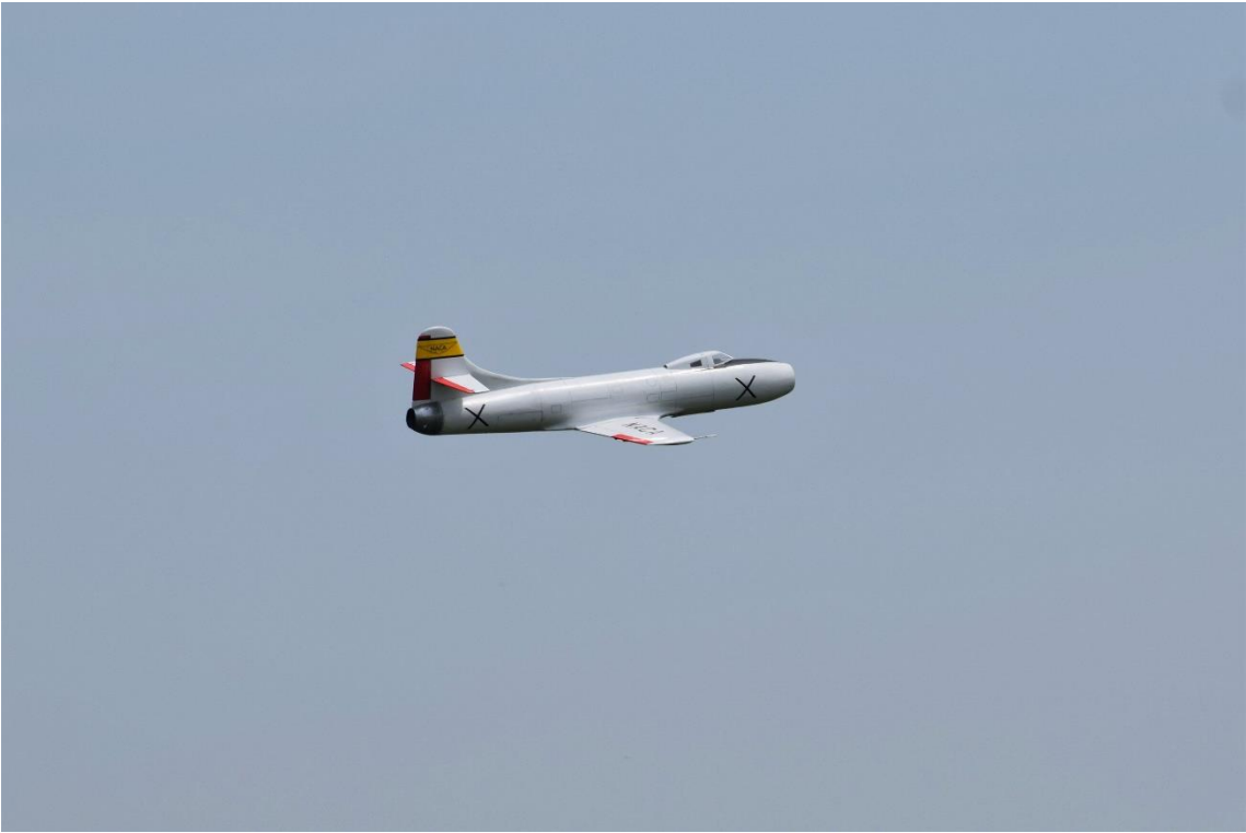
The Douglas D-558-1 Skystreak flew at the EDF Jet Jam in Indiana.