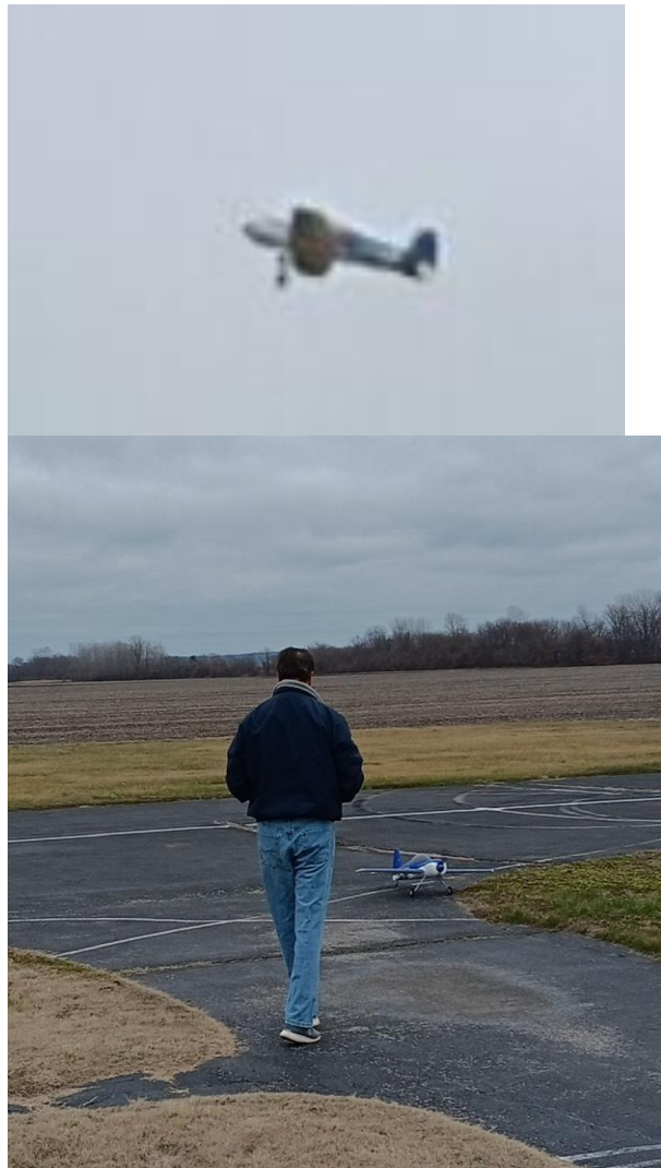
Brad's plane is hidden in the trees.